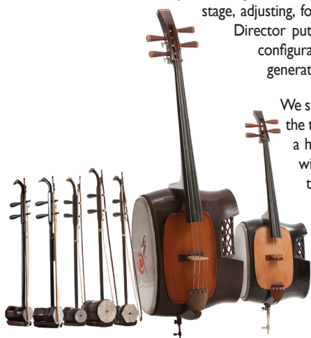
環保鼎式高胡、環保高胡、環保中胡、環保二胡、環保低音革胡、環保革胡 Ding-style Eco-Gaohu, Eco-Gaohu, Eco-Zhonghu, Eco-Erhu, Eco-Bass Gehu, Eco-Gehu