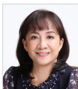
教育主任 Education Executive